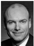
David E. Thring

The recent decision of the Supreme Court of Canada in Saulnier (Receiver of) v. Saulnier has changed the basis for determining whether a licence is property under a provincial Personal Property Security Act (“PPSA”) and the federal Bankruptcy and Insolvency Act (“BIA”).