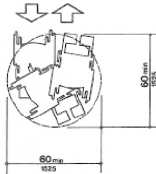
(a) 60-in (1525-mm)-Diameter Space

1 accessible route) & 4.2.3 (“The space required for a wheelchair to make a 180-degree turn is a 2 clear space of 60 inches diameter (see Fig. 3(a)) . . .”). Figure 3(a) illustrates the latter turning 3 space.