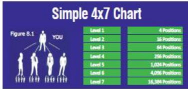
How the Executive Organization works. - Figure 8.1

Each Executive in Livinity is allowed four Executive positions on his or her first level. Because you have four positions on your first level, and each of those has four on their first level, you will have a total of sixteen positions on your second level. Your 4 x 7 Executive Organization has seven levels and the number of positions increases by a factor of four with each new level.