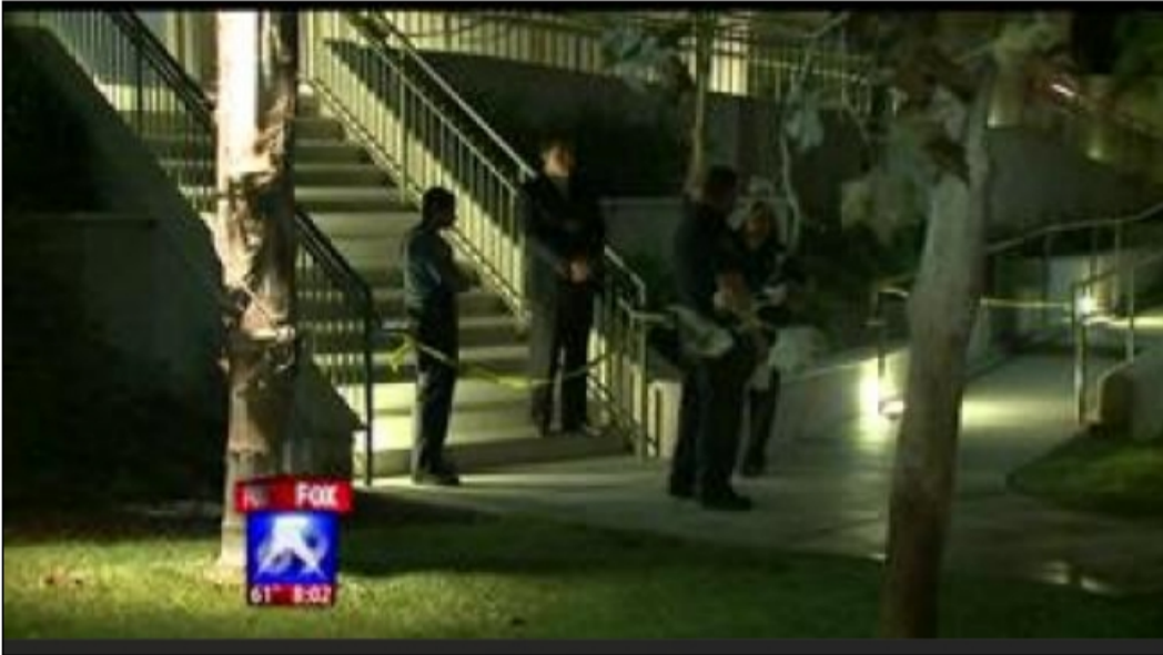
University City Murder Investigation