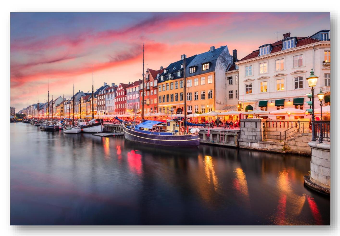
DAHL LAW FIRM ESTABLISHING A BUSINESS ENTITY IN DENMARK