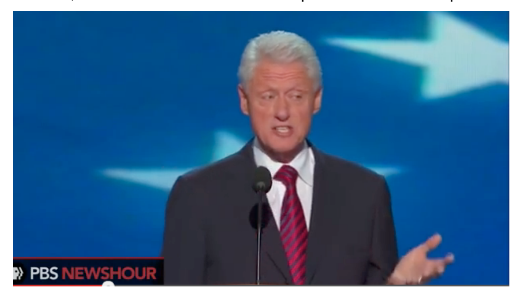
Watch President Clinton Deliver Nomination Address at the DNC

If you have a little time, watch some or all of these two political convention speeches.