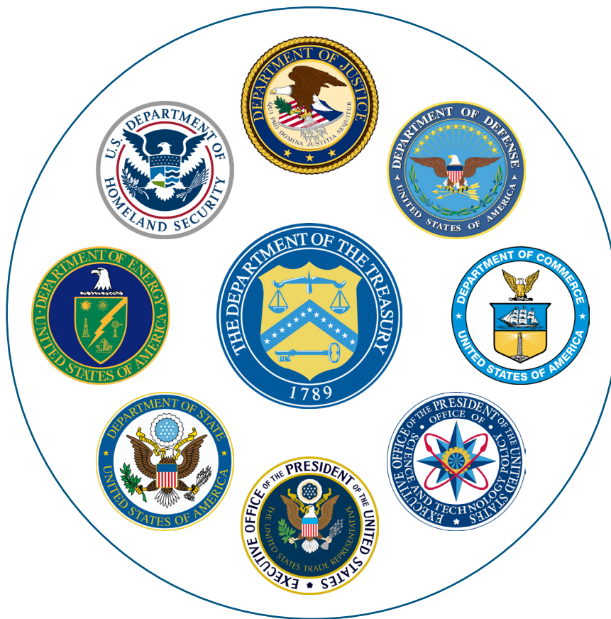
Composition of CFIUS

CFIUS is chaired by the Secretary of the Treasury. The following US government parties also participate in the process: the Departments of Justice, Homeland Security, Commerce, Defense, State, and Energy; the Office of the US Trade Representative; and the Office of Science and Technology Policy. The Director of National Intelligence and the Secretary of Labor are non-voting members of CFIUS. Representatives from other federal agencies, including several White House offices, also observe and, as appropriate, participate in CFIUS's activities.