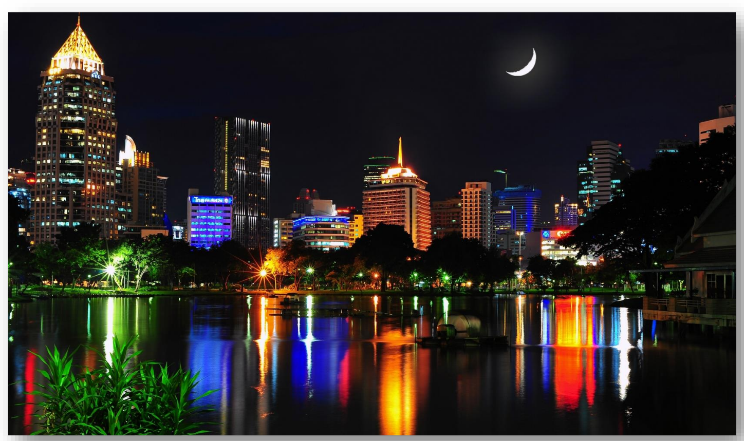
DEJ-UDOM & ASSOCIATES LTD. ESTABLISHING A BUSINESS ENTITY IN THAILAND