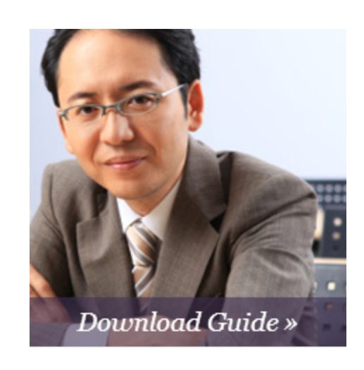
A stack of forms can't "know" the nuances of your situation. Work with an attorney experienced in international estate planning to craft a plan that fits your unique circumstances. Protect your loved ones and assets by examining your options now »

Dai reads online about the importance of having a <u>revocable</u> <u>living trust</u> in the U.S. Dai has seen those online legal programs where it is possible to purchase do-it-yourself-forms. To Dai it seems like a good option. He uses a do-it-yourself form to establish the trust.