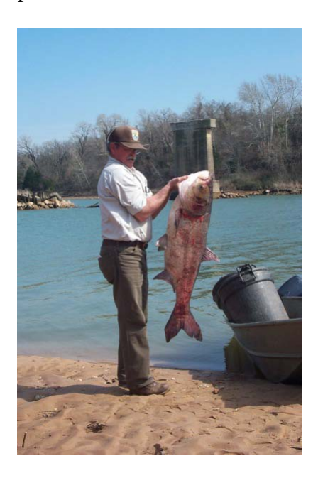
Figure 1: Bighead Carp<sup>4</sup>

amounts of plankton, starving out native species.<sup>3</sup> They are analogous to an uninvited wedding guest who gorges on the buffet table (plankton) before the other guests (native fish populations) can fill their plates.