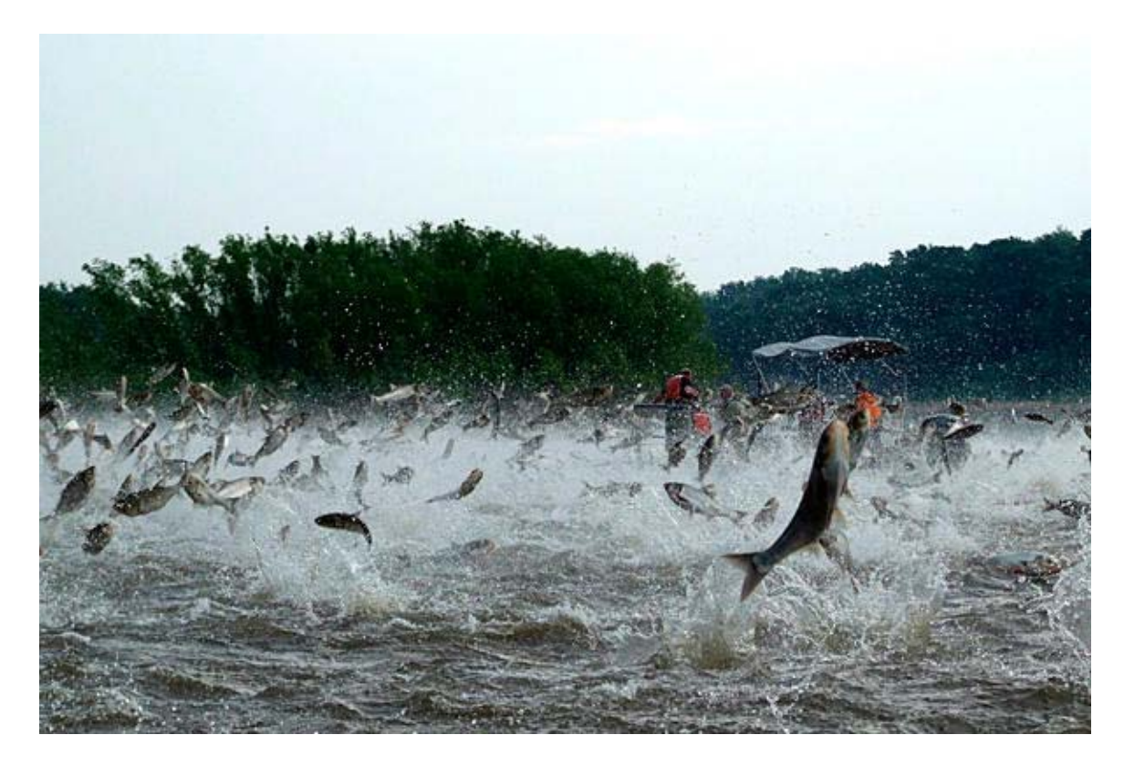
Figure 2: Silver Carp<sup>8</sup>

four degrees Celsius<sup>6</sup>. Black carp can grow as long as seven feet and weigh 150 pounds, feeding on snails and mollusks. One black carp can consume ten tons in its lifetime.<sup>7</sup>