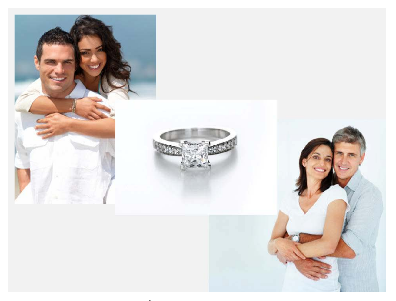
Fiancé Visa Guide