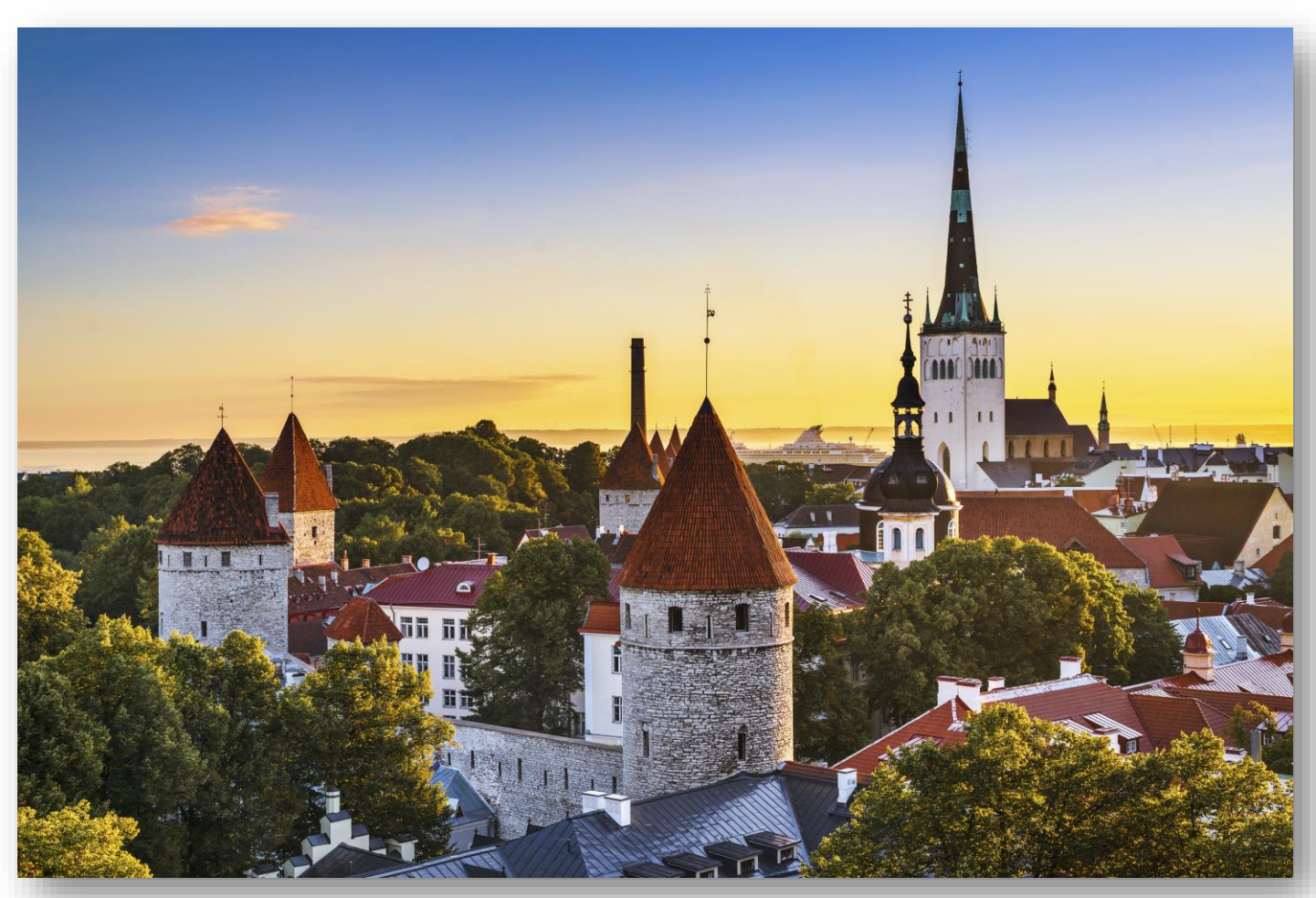
TGS BALTIC ESTABLISHING A BUSINESS ENTITY IN ESTONIA