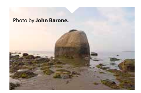
The winner of a $50 gift card to 2 spring this month is Terri D'Aquila. Congrats!

August's photo is of Target Rock located at the Target Rock Preserve. The rock was given its name because British warships were said to have used it for target practice.