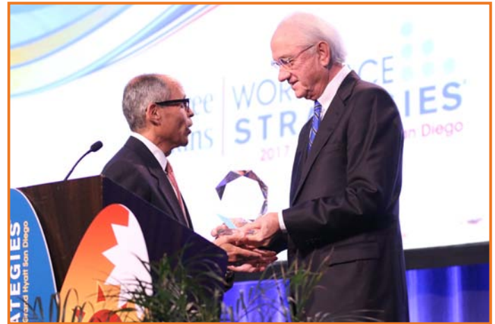
Ogletree Deakins donated $40,000 to Father Joe's Villages, a San Diego-based organization that supports thousands of military veterans and homeless children and adults in the San Diego community.