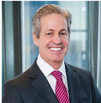
Norm Coleman Senior Counsel, Washington, D.C. Tel +1 202 637 5440 norm.coleman@hoganlovells.com