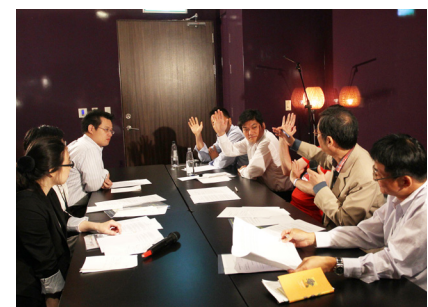
The mock jurors deliberate in Taipei