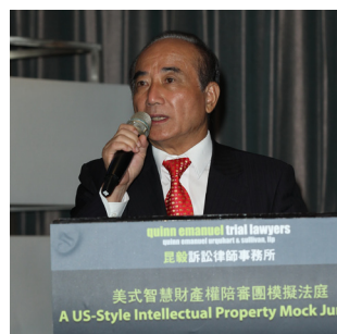
Wang Jin-Pyng makes remarks in Taipei