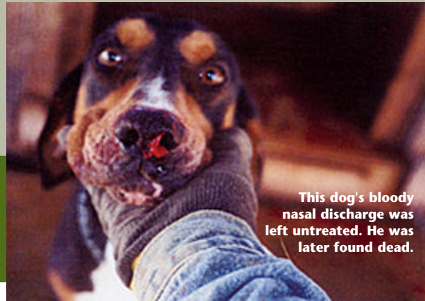
This dog's bloody nasal discharge was left untreated. He was later found dead.