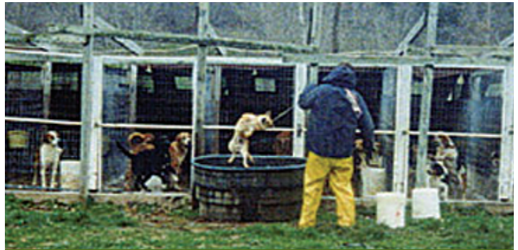
Dogs were dumped into a tank of water containing three one-quart bottles of Permethrin, a chemical to kill and prevent fleas and ticks. The insecticide covered every inch of dogs dumped into the tank, including their eyes and open wounds. Smaller dogs were hoisted up by their necks... This procedure was done in temperatures so cold, the dogs would go into shock before being dragged by their necks back to their pens.