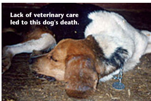
Lack of veterinary care led to this dog's death.