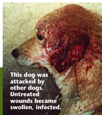
This dog was attacked by other dogs. Untreated wounds became swollen, infected.