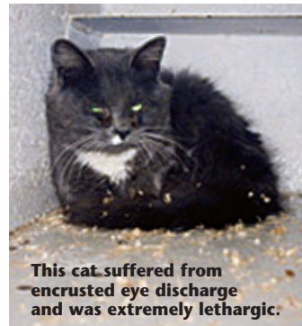
This cat suffered from encrusted eye discharge and was extremely lethargic.