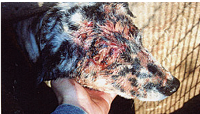
An injection of a swine antibiotic was the only attempt by kennel workers to treat the infected bite wounds on this dog's head. The dog eventually died.