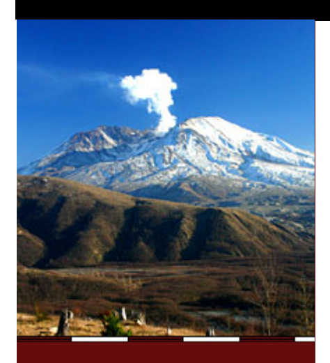
Mt. St. Helens, Washington