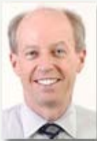
Patrick Malone & Associates

What Are Lemons > Your Rights > Avoid a Lemon >