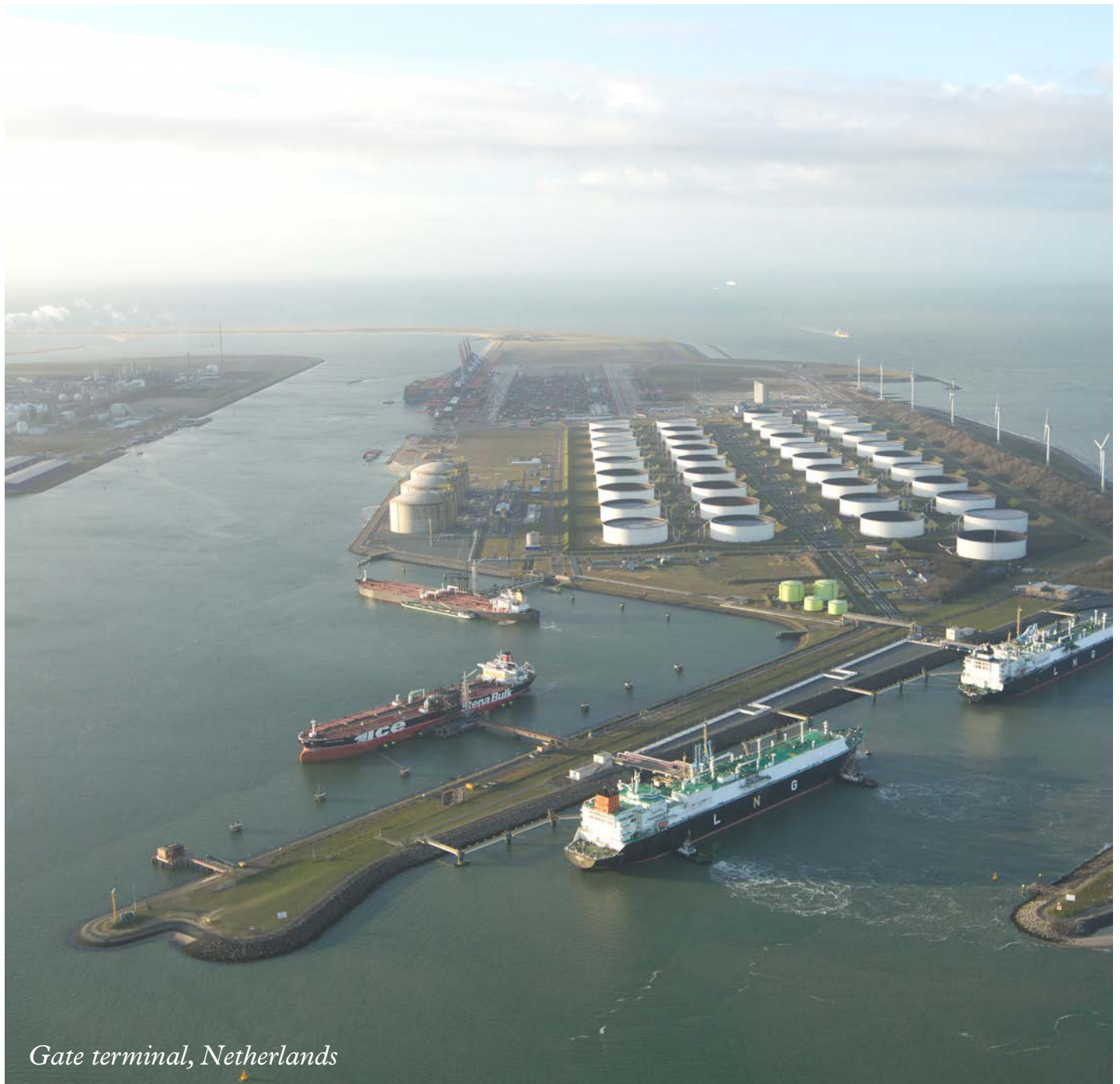
Gate terminal, Netherlands