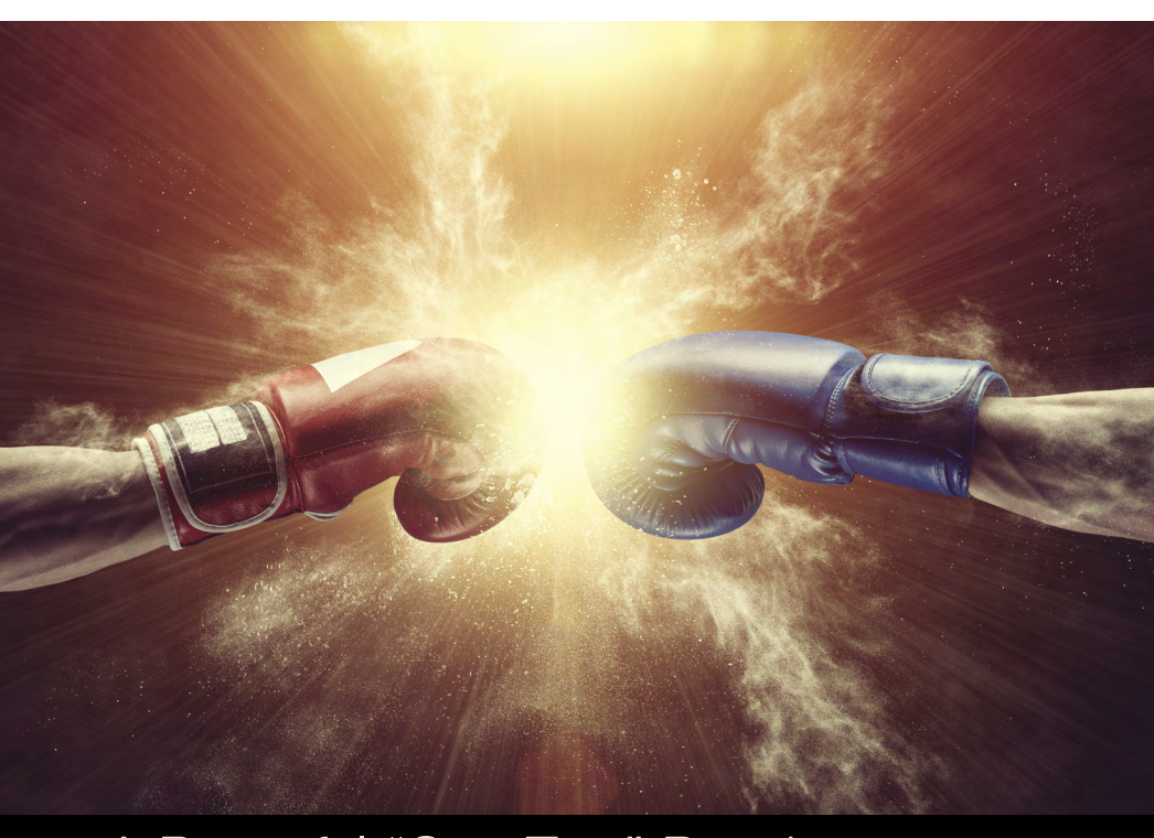
A Powerful "One-Two" Punch: NLRB and DOL Signal Contractor Classification Crackdown