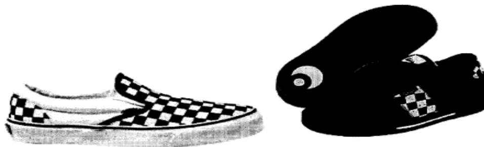
22 23 CLASSIC SLIP ON

11 Plaintiff filed the instant lawsuit, alleging Defendant’s registration for its Classic Slip-On deck 12 shoe does not confer rights to the generic pattern of a black and white checkerboard nor does it 13 preclude third parties, like Plaintiff, from using decorative checkerboards on shoes for design, 14 descriptive, or non-source identifying purposes. (Doc. No. 1.) Plaintiff utilizes the checkerboard 15 pattern on its “Serve Black” shoe, which is pictured alongside the Classic Slip On below: